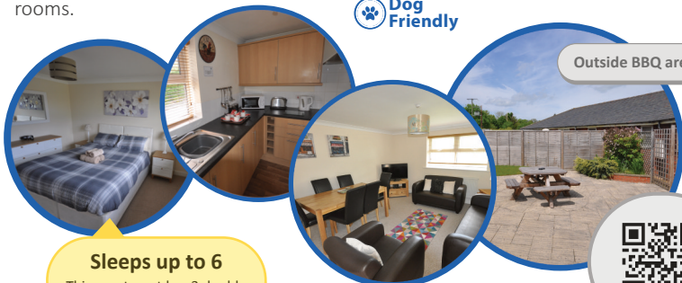
Outside BBQ area

Sleeps up to 6 This apartment has 3 double rooms and 1 bathroom